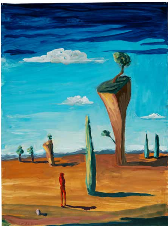
George Condo (b. 1957) “Thought Trap”, 1983, acrylic, gouache and oil on paper 55,9 x 41,9 cm

to a career that includes membership in a series of punk-adjacent musical bands and an impressive catalogue of work for book and album covers, including Kanye West’s My Beautiful Dark Twisted Fantasy .