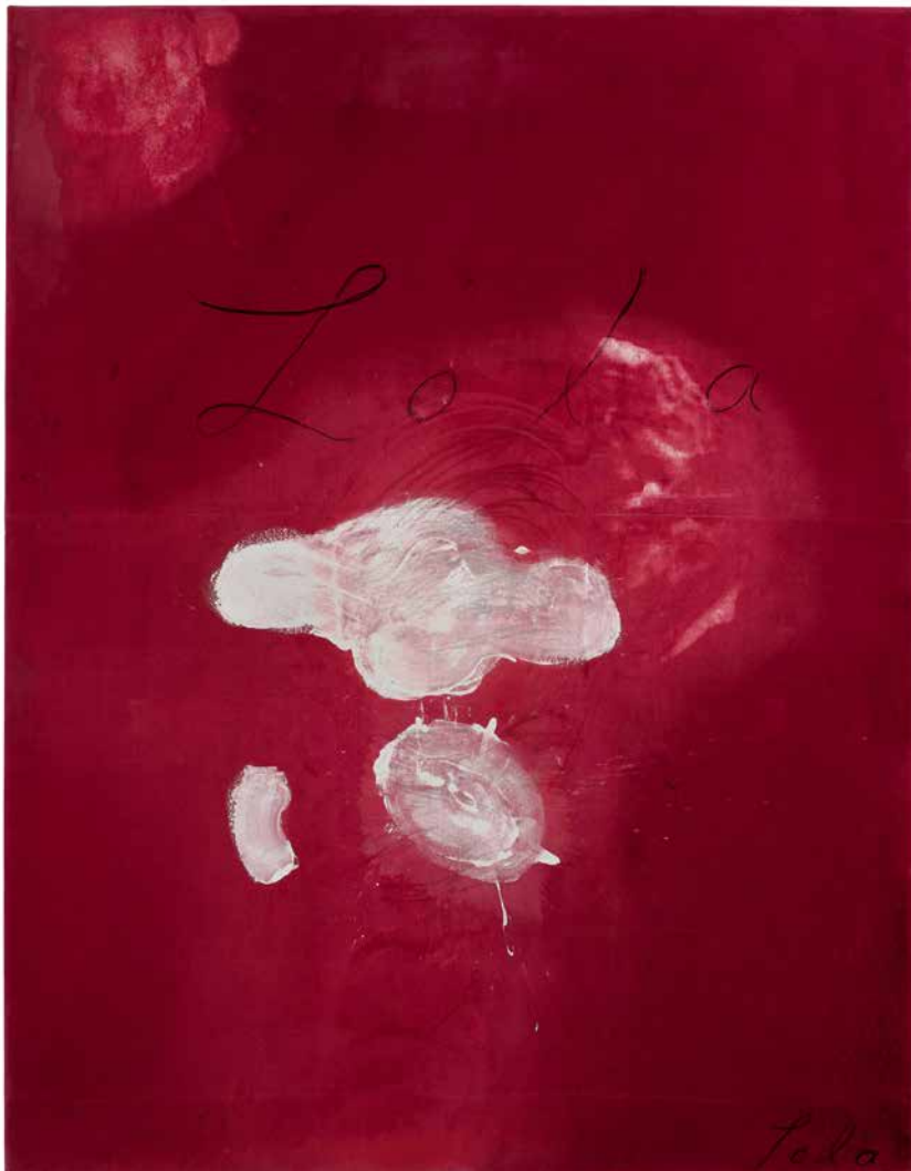
Julian Schnabel (b. 1951)

Interior and exterior, landscape and mindset, chaos and form: art thrives on tracing the dichotomies of our human existence in the world, and the mid-20th century found its great artists toying with and teasing out the creative potential of our fundamental conflicts with vibrant energy.