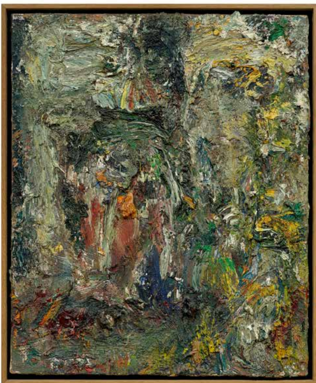
Eugène Leroy (1910 – 2000) "Tête et paysage", 1990, oil on canvas, 73,0 x 60,0 cm, ©Eugène Leroy, courtesy Daniel Blau, Munich