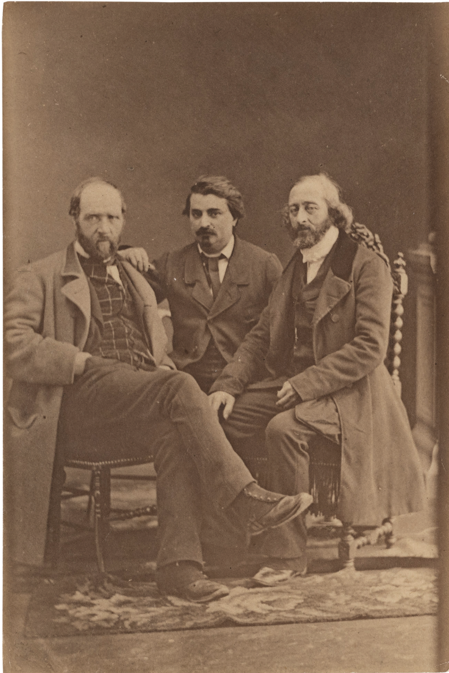
LOUIS ALPHONSE POITEVIN (1819-1882)