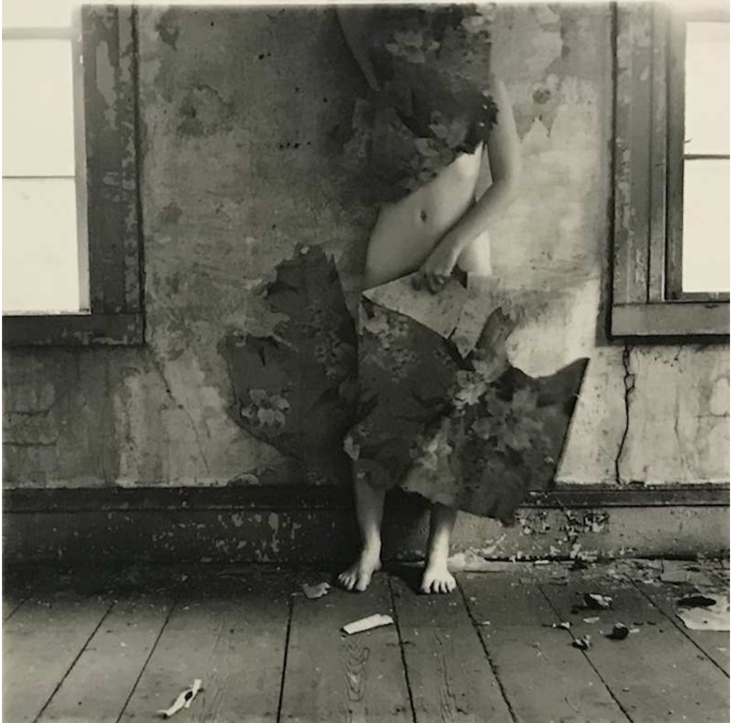
Monnaie de Paris Women House Francesca Woodman

I fell in love with Francesca Woodman's black and white photograph of nude female bodies merging with their surroundings, and whose faces are obscured. This highly talented artist died by suicide at the age of 22. Sad that she could not see how much her work has inspired artists and left a strong imprint in Art History.